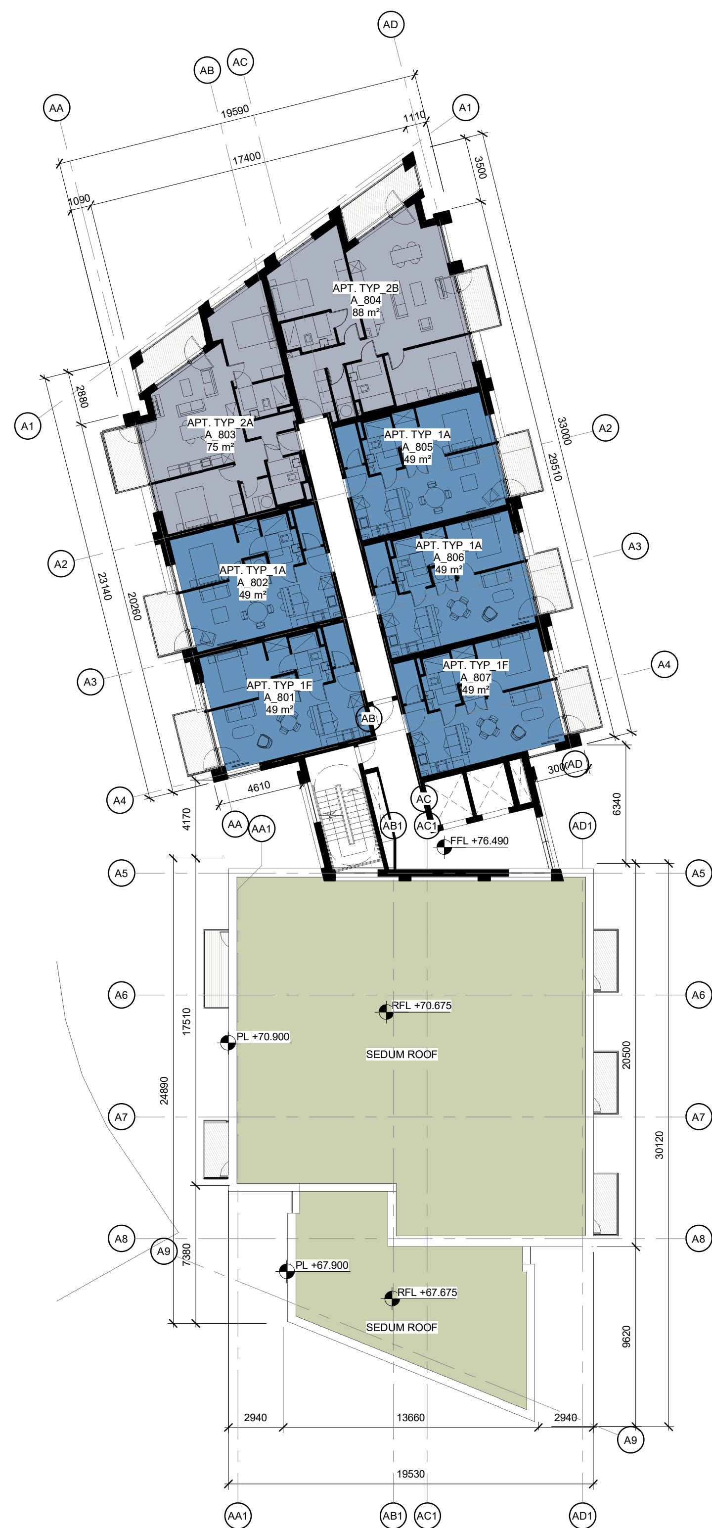
1 Building A -Eighth Floor Plan 1 : 200