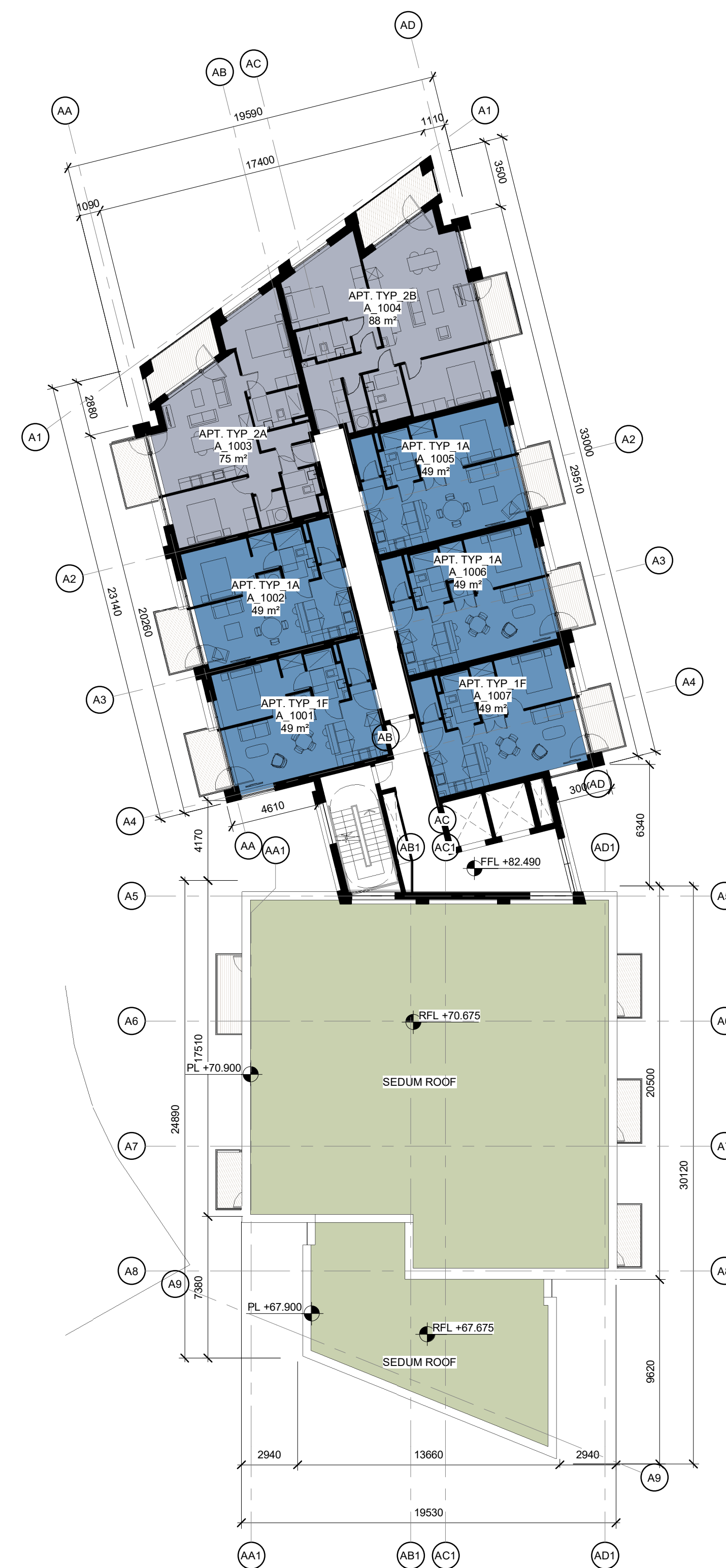
3 Building A -Tenth Floor Plan 1 : 200